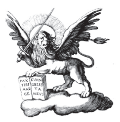
Iterum rudit Leo The Lion roars again

On the right: The panoplies or military trophies that adorn the vertical borders of the flag, to the left and right of the Lion of St Mark.