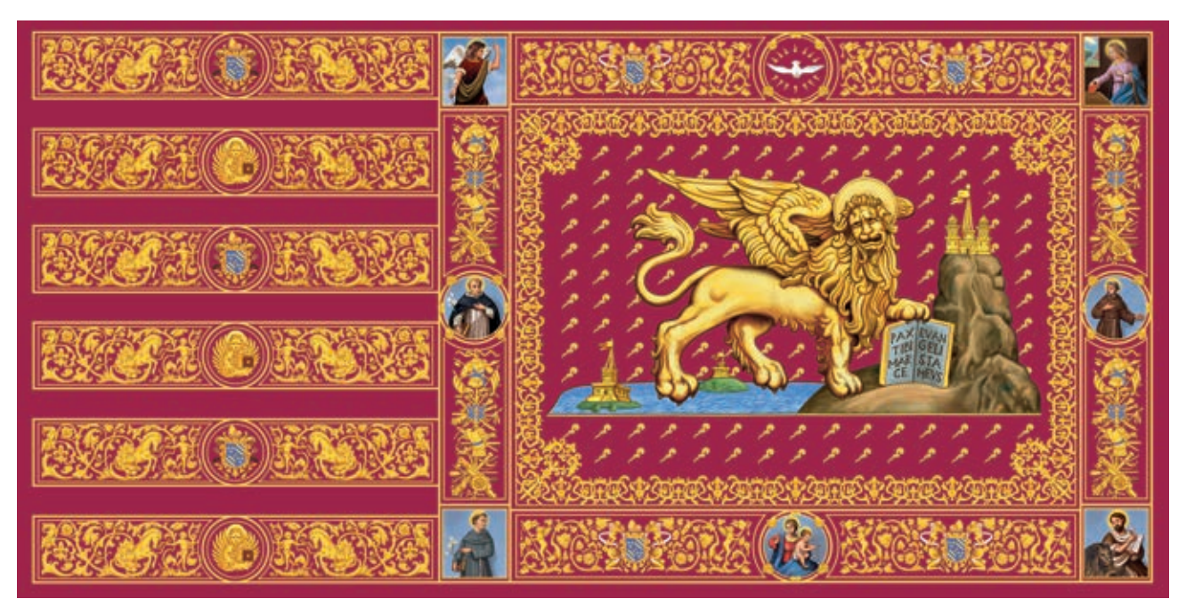
The flag of Doge Contarini (17th century) in the traditional horizontal version, entirely redesigned by the illustrator Oliviero Murru.

The flag, in its traditional horizontal version, as seen above, has been reproduced in a limited number of copies, the costs involved being extremely high. It is available in the following formats with the respective cost prices: